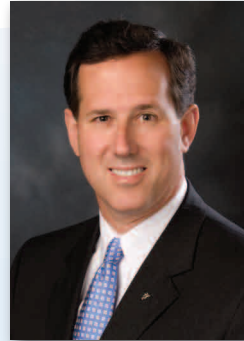
National Hero of Faith Award Hon. Rick Santorum